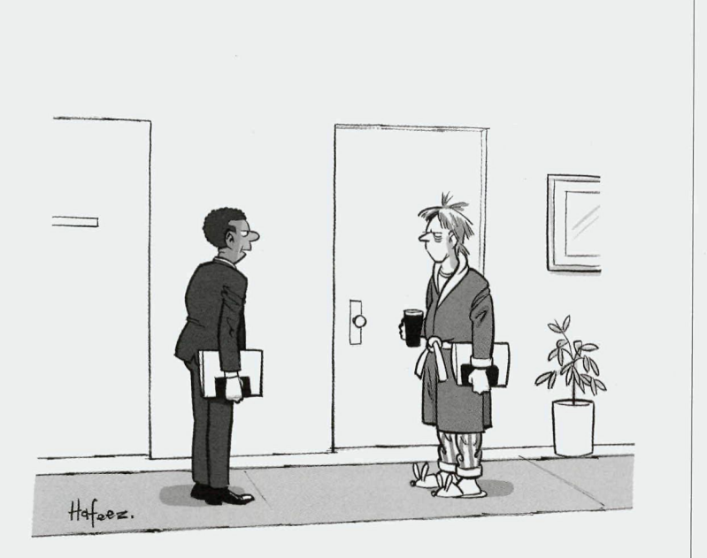
"Oh, so you're homing from work today."

Experiment, iterate, learn. As I've said for many years, a big mistake companies make all the time is planning new ventures with the same approaches they use for more-established businesses. Instead, they need to focus on experimentation and learning, and be prepared to make a shift or change emphasis as new discoveries happen. The discovery phase is followed by business model definition and incubation, in which a project takes the shape of an actual business and may begin pilot tests or serving customers. Only once the initiative is relatively stable and healthy is it ramped up. All too often, in their haste to get commercial traction, companies rush through this phase; as a result whatever product they introduce has critical flaws. They